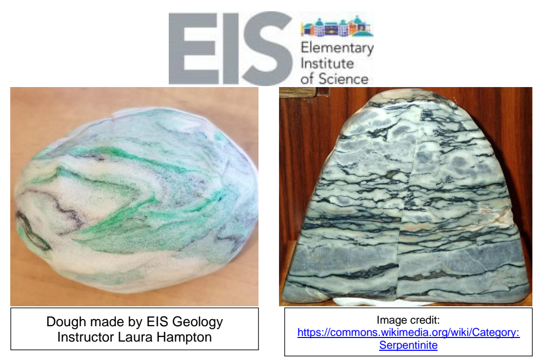
Homemade dough versus serpentinite metamorphic rock.

2. Using colored pencils in the same color family, color your topographical map. See if you can make the lowest point the darkest, and color each step lighter, and lighter. The top of your mountain should be super light in color.