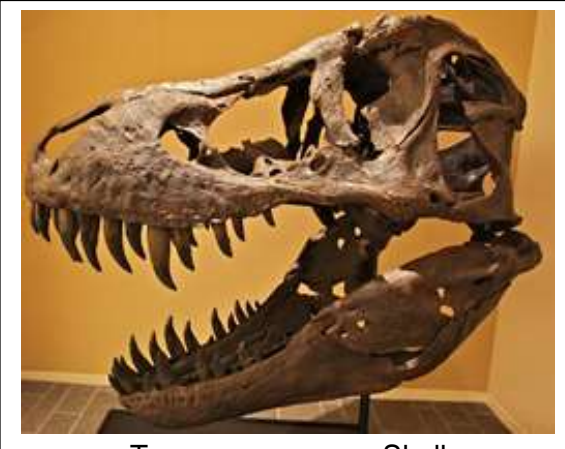
Tyrannosaurus rex Skull