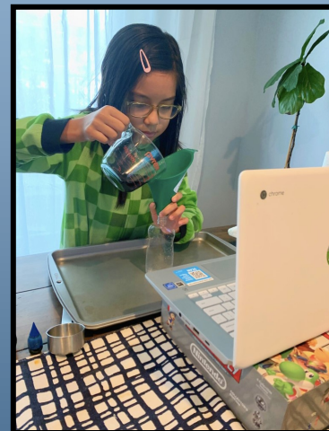
Small class sizes!